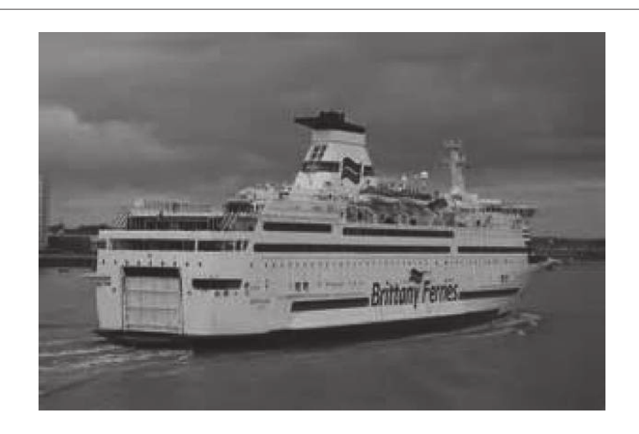
Fig. 3 for Question 3